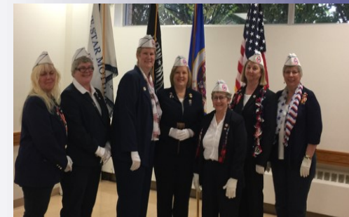
DEPARTMENT OF MINNESOTA