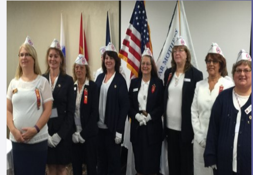
DEPARTMENT OF MICHIGAN