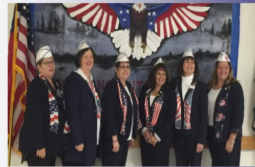
DEPARTMENT OF OHIO