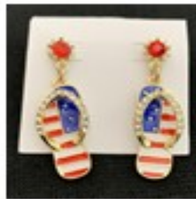
Item #14 Gold Flip Flop Earrings