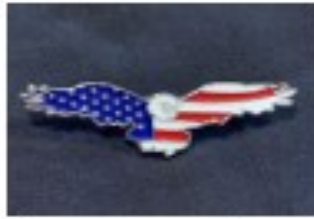
Item #2 Eagle Pin