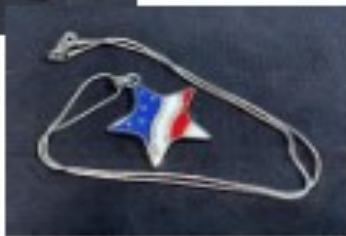
Item #10 Star Earrings & Necklace Bundle