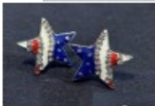
Item #8 Star Earrings