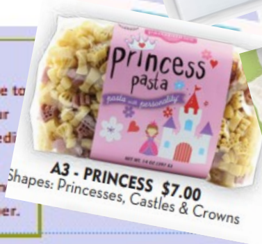
A3 - PRINCESS $7.00 Shapes: Princesses, Castles & Crowns

Sharing is caring...feel free to share this link with all your friends, on your social media pages and in person. The more we buy, the more money we bring in to Big Dipper.