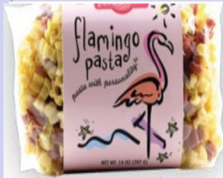
A8 - FLAMINGO $7.00 Shapes: Flamingos & Suns

If your order is under $65, there is a flat rate of $8.95