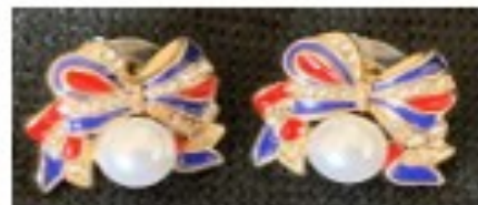
Item #16 Bow Earrings