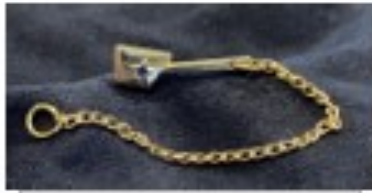
Item #1 Big Dipper Guard Pin