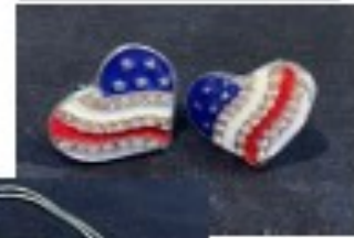
Item #3 Heart Earrings Item #4 Heart Necklace