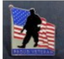
Item #7 Proud Veteran Pin