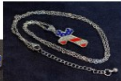
Item #12 Patriotic Cross Necklace