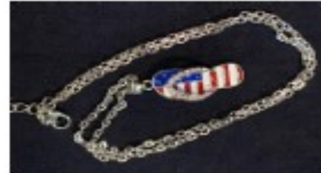
Item #13 Silver Flip Flop Necklace