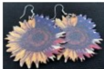
Item #15 Wooden Sunflower Earrings