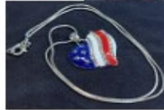
Item #3 Heart Earrings & Necklace Bundle