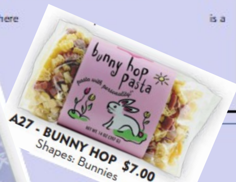
A27 - BUNNY HOP $7.00 Shapes: Bunnies