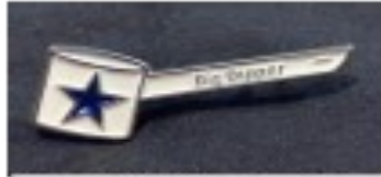
Item #5 Big Dipper Lapel Pin