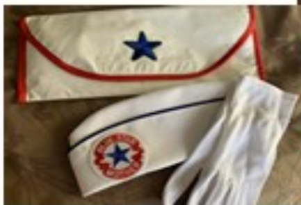
Item #17 Blue Star Hat Bag – Hat and Gloves available through the National Online Store – Lining of the interior of the bag varies.