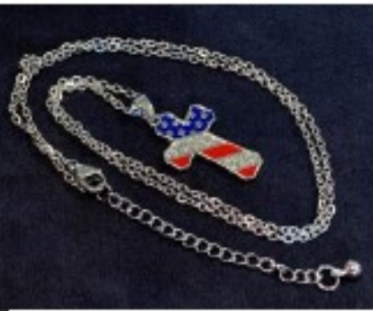
Item #11 Patriotic Cross Pin Item #12 Patriotic Cross Necklace