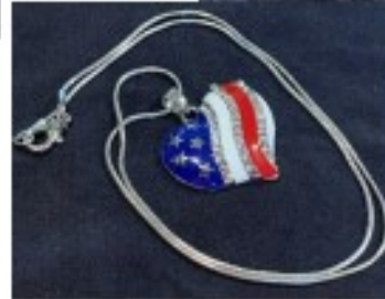
Item #5 Heart Earrings & Necklace Bundle