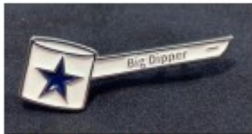
Item #6 Big Dipper Lapel Pin