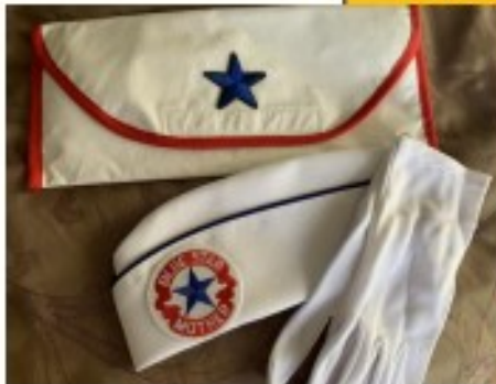
Item #14 Hat Bag (Gloves and Hat not included. They are available through the National BSM Online Store.