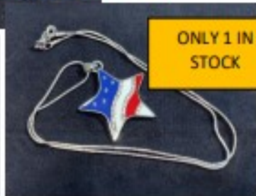
Item #9 Star Necklace