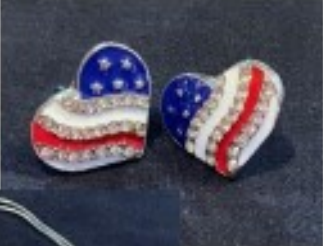
Item #3 Heart Earrings Item #4 Heart Necklace