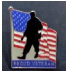
Item #7 Proud Veteran Pin