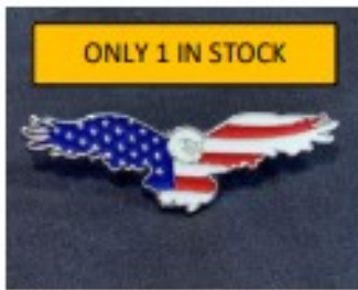
Item #2 Eagle Pin