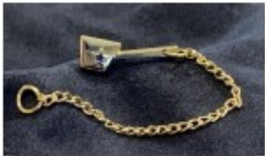
Item #1 Big Dipper Guard Pin