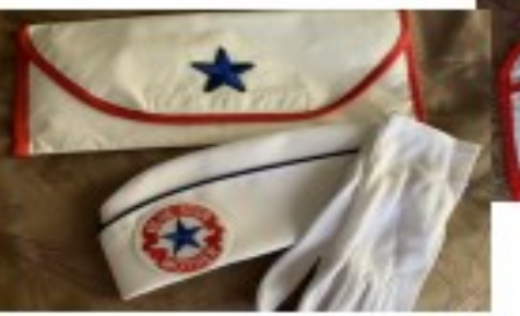
Item #17 Blue Star Hat Bag - Hat and Gloves available through the National Online Store - Lining of the interior of the bag varies.