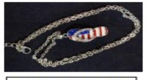
Item #13 Silver Flip Flop Necklace