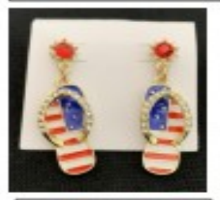
Item #14 Gold Flip Flop Earrings