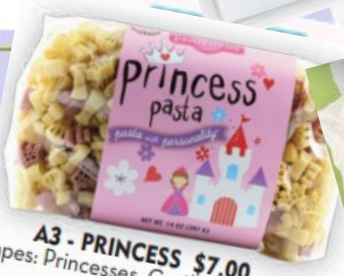
A3 - PRINCESS $7.00 Shapes: Princesses, Castles & Crowns