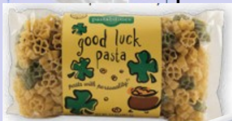
A26 - GOOD LUCK $7.00 Shapes: Shamrocks & Cloves