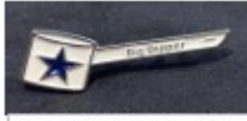
Item #5 Big Dipper Lapel Pin