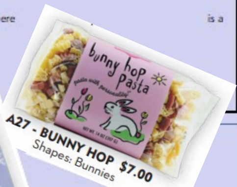
A27 - BUNNY HOP $7.00 Shapes: Bunnies