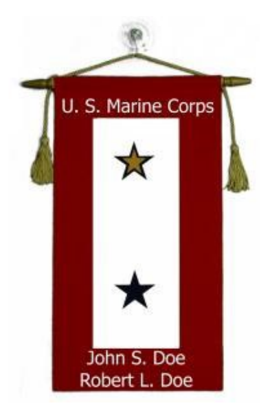
GOLD & BLUE STAR FELT BANNER