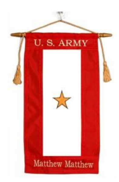
SATIN GOLD STAR BANNER