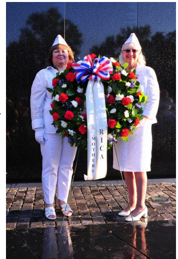
cred grounds; where only Presidents, heads of states, and dignitaries have stepped.....at the Tomb Of The Unknowns .

All I knew was that this was one of the greatest honors- to lay a wreath honoring the Tomb of the Unknowns and the Gold Star Families' sons and daughters on one of the Nation's most sa-