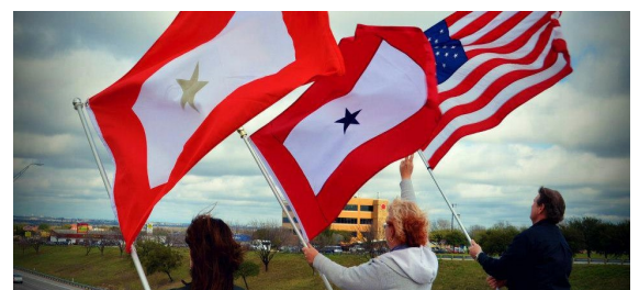
Wilco Blue Star Mothers (TX15) show their respect for Navy SEAL Chris Kyle