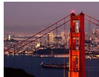
San Francisco Skyline

It will be a wonderful event; looking forward to seeing you there!