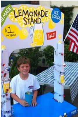
This young entrepreneur raised $82 on July 4 for the South Bay Blue Star Moms (CA4).