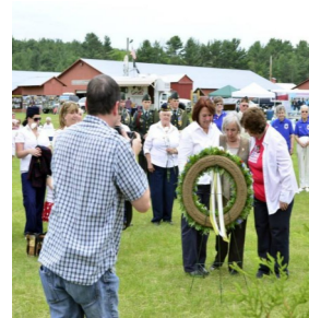
Blue Star Mothers of New Hampshire (NH1) Tribute Wall, Haverhill, NH 5-26-13