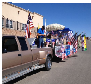
Blue Star Mothers win 1st Place in the Espanola Fiesta Parade... Congratulations TEAM!! (NM4)