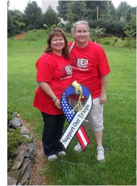
If they're wearing RED , it must be Friday! ( R emember E veryone D eployed) (VA4)