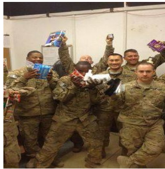
Troops in Afghanistan receiving East Bay Blue Star Mom's (CA101) Care Packages for July 4th.